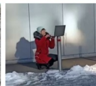
School teacher outside of a supermarket with internet connection

On February 24, a public conference with the title "Consequences of the Russian War of Aggression for Science and Research in Ukraine" was held in the Kollegienhaus under the leadership of the initiative Ukrainian Research in Switzerland (URIS) and supported by National and International Cooperation. URIS has been working since 2015 to strengthen expertise on Ukraine in Switzerland and is coordinated by the University of Basel. About half of our Ukrainian researchers and doctoral students from a total of five faculties presented at the event. In sixteen talks, they offered impressive and unique insights from their respective fields and regions of origin on topics such as "The Psychological Consequences of War," "The Humanities in War," "The Situation of Students and Doctoral Students," "Peace Building, Law, and Toxicology," and "Consequences for Archives and Cultural Institutions." A large, broad audience learned first-hand about how Ukrainian universities have been trying to maintain teaching operations despite dangers and great difficulties (especially online) and how studying and research have been carried out in this country while families, friends, fellow students, and colleagues are on duty in the military or in civilian services.