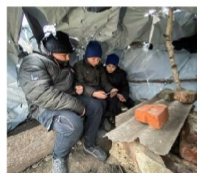
Schoolchildren in a makeshift tent rely on mobile internet