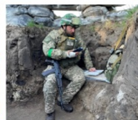
University professor delivering a lecture to his students